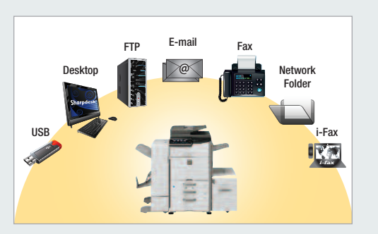
Sharp's integrated network scanning offers one-touch document distribution to up to seven destinations.