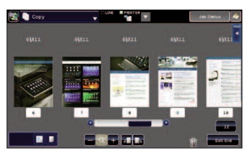
Easily edit documents in scan preview mode.