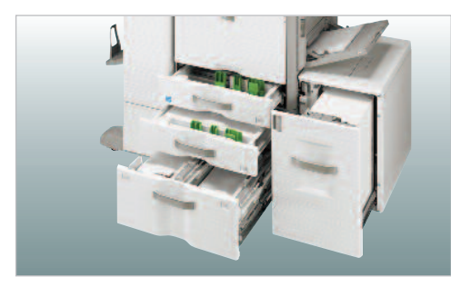
Available paper capacity stores up to 6,600 sheets.

This series offers a choice of two high-performance finishers that can give your documents a professional look and feel. Choose from a compact inner finisher or floor-standing saddle-stitch finisher . Both finishers offer three-position stapling and an available 3-hole punch.