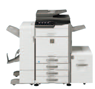
MX-3640N shown with saddle-stitch finisher and optional MX-LC11.