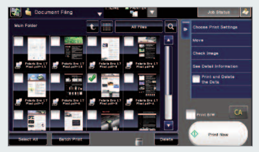
Sharp's Document Filing System with thumbnail preview makes it easy to locate and retrieve stored jobs.

State-of-the-art belt fusing system consumes less power and shortens warm-up time.