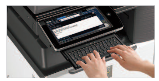
Full-size retractable keyboard simplifies data entry.